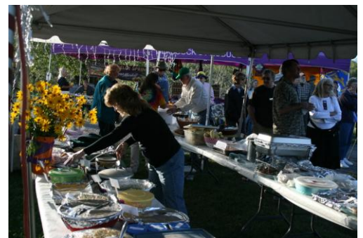
Local Food Table at BFBLWV Event